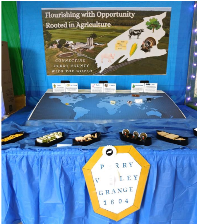
Third Place at Perry County