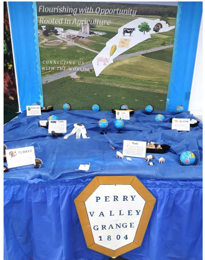
Third Place at Juniata County